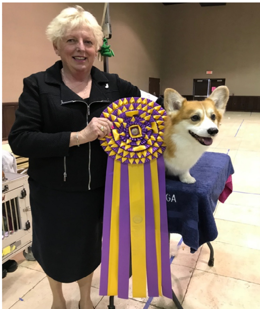
2018 PWCCA NATIONAL BIS GCH CH EWEKNOW HEARTS RUN FREE