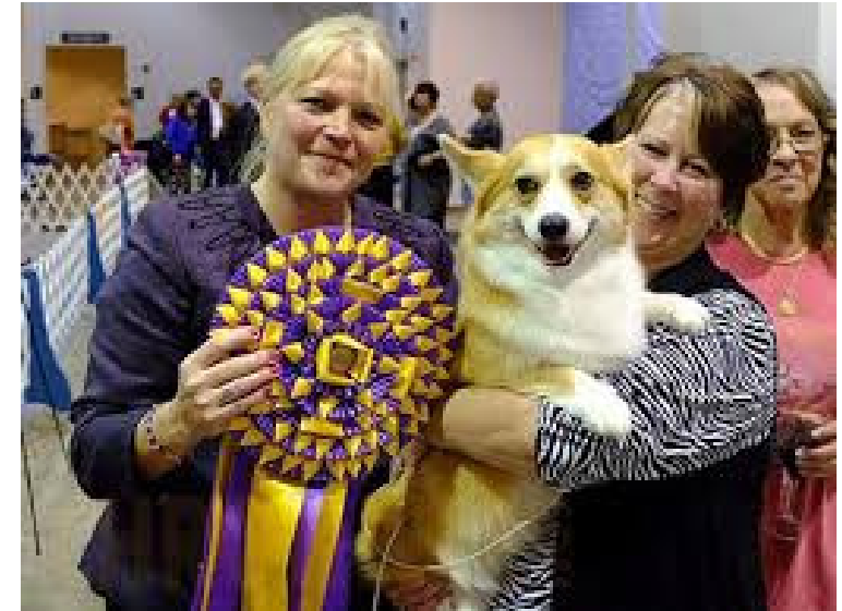
2016 PWCCA NATIONAL BIS GCH DOUBLE G'S CATAMARAN'S THAT KIND OF GIRL