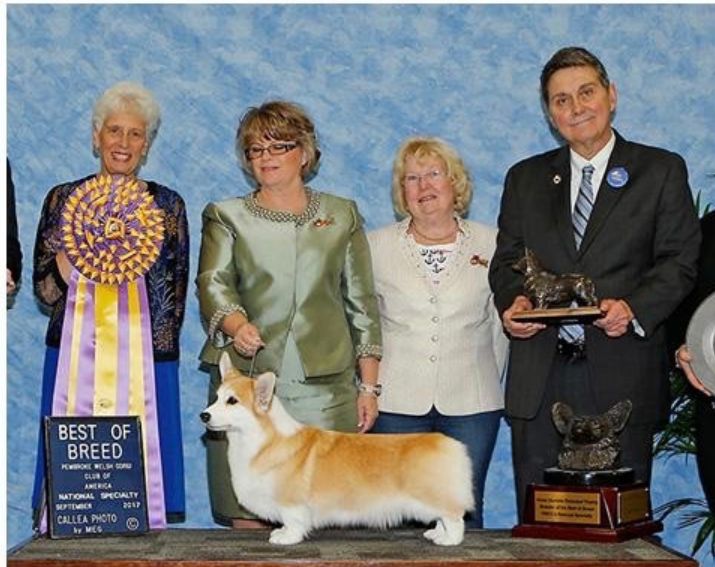
2017 PWCCA NATIONAL BIS GCH LANDIAN'S CHAMPAGNE ON ICE