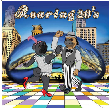
Agility At The Farm

8N861 Burlington Road, Campton Hills, IL 60140