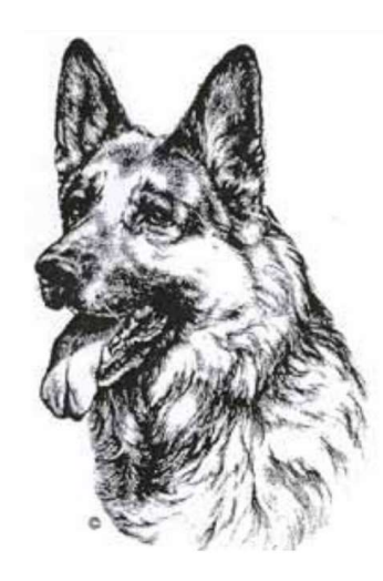
Pride on Parade

Lincolnwood Training Club's 81<sup>st</sup> annual Obedience Trial for German Shepherd Dogs celebrates eight decades of holding specialty obedience trials for German Shepherds in the Chicagoland area. Lincolnwood is one of the nation's first obedience clubs devoted to this wonderful breed.